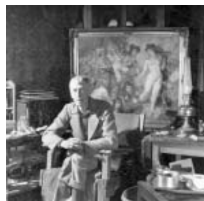
Norman Lindsay pictured in his painting studio circa 1930s

Although there are two BMFHS Library volunteers on duty for guaranteed sessions Tuesday and Thursday, 10am to 1pm to assist members and the general public, February to November each year, there are also volunteers on duty most Mondays, Wednesdays and Saturdays (but these are not guaranteed days).