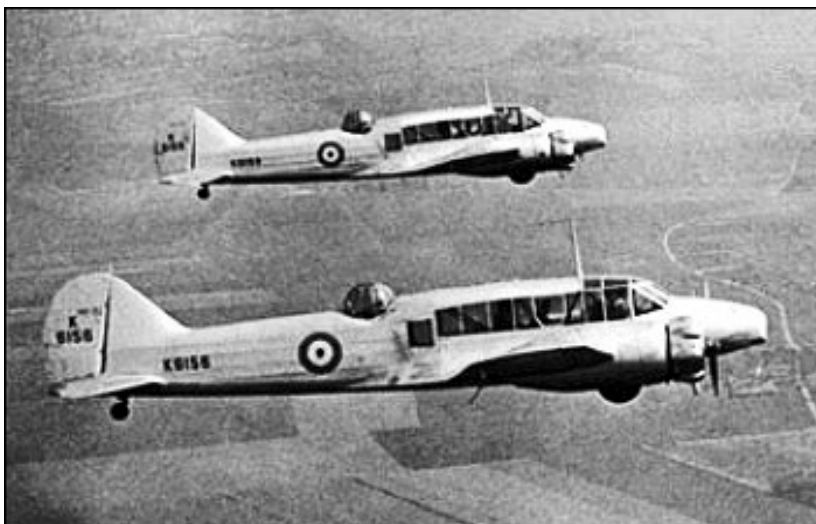
Avro Ansons similar to the one that crashed at Glenbrook

The five parachutes were found at the scene.