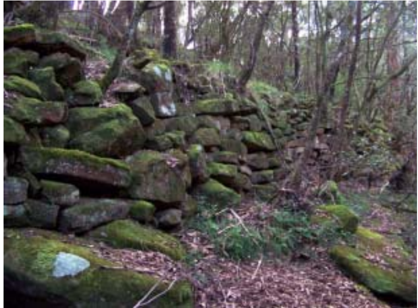
Remnants of the race, stone work and the mill pond are visible today.

This route was the first European track north to the Hunter River but was soon superseded by the construction of the Great North Road.