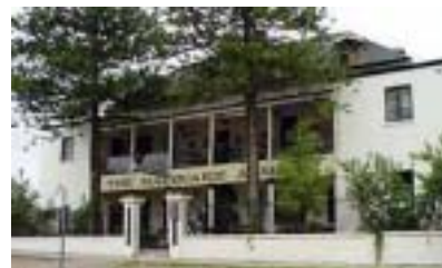
The Macquarie Arms (built between 1812 and 1815)

The roadways in and across the square have evolved organically from the early tracks down to the punt, and naturally have brought changes to the contours and grassy spaces within the total area, but they have all remained low-level, sympathetic in bulk and scale, and so have continued unobtrusive for 217 years.