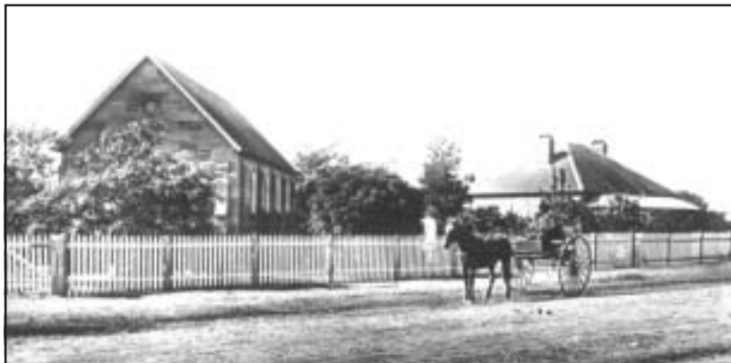
Scots Church circ 1932

For bookings contact Kath Wilkins 4577 3842.