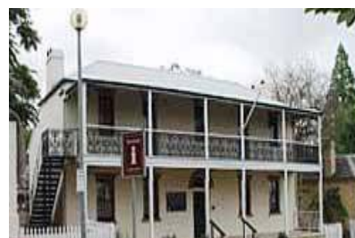
Howe's House (1820s) now part of the Hawkesbury Regional Museum