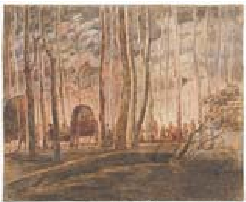
Spring Wood by Lewin, JW. State Library of NSW collection

Lewin also produced commissioned works for every colonial governor, his most notable being the watercolours of the Blue Mountains and 12 large natural history works and landscapes for Governor Bligh in 1807, just a few months before he was overthrown.