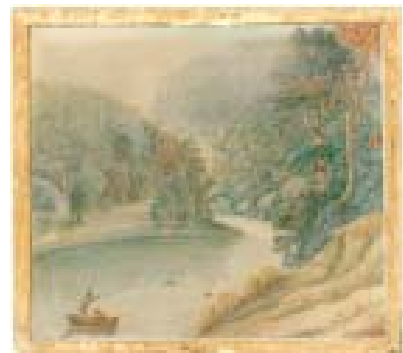
Emu Creek by Lewin, JW. State Library of NSW collection

Lewin: Wild Art is a free exhibition at the State Library of NSW until May 27, 2012 then from July 28 to October 28 at the National Library of Australia at Canberra. For those who can not visit the exhibition in Sydney, they can visit www.sl.nsw.gov.au/lewin and view John Lewin's beautiful artwork in amazing detail using the collection viewer. Zoom in on over 150 images featured in the exhibition and watch the video commentary which has been added to selected artworks.