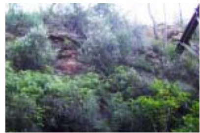
Two of the five flowering Leptospermum rupicola plants high on the 1902 northern face of the railway cutting

What have I learnt by this experience? The RMS engineers and designers and contractors have done a quite remarkable job on what they are trained to do: building a highway diversion and rail cutting.