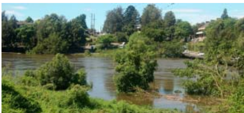
A photograph of Thompson Square on March 3, 2012 from the opposing bank of the river when the water was very high, close to the decking of the existing bridge on the right.

Such a new bridge elsewhere is more costly, which was, naturally, an important consideration in the preference and given to the Thompson Square option, but it is inevitable and would be good planning.