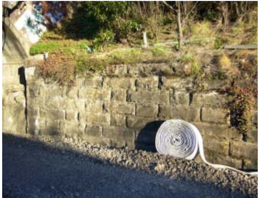
The 1866/67 sandstone abutment on the southern side of the original 1867 rail track. Note the shadow on the left that shows where the 1866-67 stone arch of the Bathurst Road bridge began. Note, too, the roll of cloth to be used to cover the wall before its burial

First , there is the 1902 Monier arch bridge that carried the Bathurst Road, crossing the east-west rail line at a north-south orientation when the line was duplicated in that year.