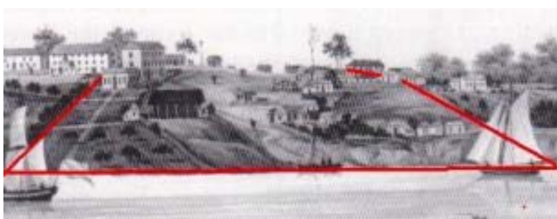
Thompson Square from much the same place, painted by GW Evans in 1809, so this is the pre-Macquarie square. It is annotated with red to show the schematic curtilage of the present Thompson Square Conservation Area.

The Thompson Square Conservation Precinct has had a place amongst listings at the top of the New South Wales Heritage Register for nearly thirty years, and this formal protection is being overridden by the state government. Now that the value of Thompson Square as Australia's only eighteenth-century civic square has been fully documented, there is