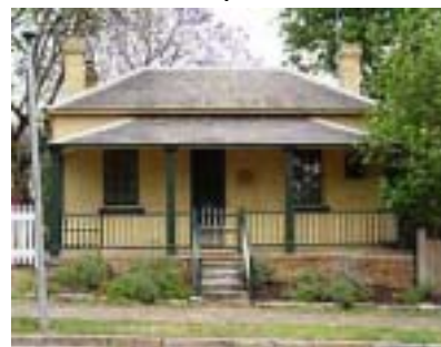
No 5 Thompson's Square built circa 1850