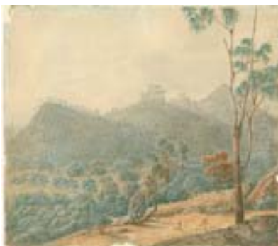
Blue Mountains by Lewin, JW.