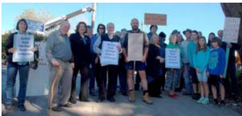
Those who took part in the protest on Friday 13 April advocating the establishment of the Sydney Rock and environs heritage reserve to protect the Rock and the old railway cutting

Day by day, more rubble from the giant Bullaburra pile on the northern side of the highway is being used to fill in that part of the cutting.