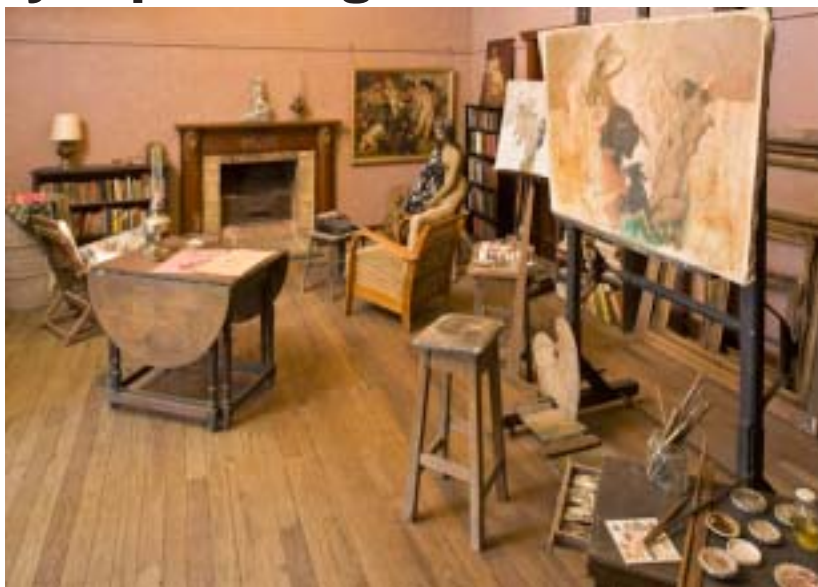
The Norman Lindsay painting studio

The restoration will include repairs to the buildings foundations, stucco walls and drainage enabling