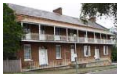
The Doctors' House (1844)

They do not interrupt the important sight-lines across the square or those from all parts of the square to the rural land opposite which is still readable as the part of the original 1794 farmers' grants.