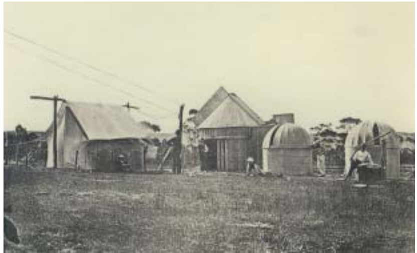
Waiting for the transit at Woodford. Photograph from Transit of Venus 9 December 1874

During a transit, Venus can be seen from Earth as a small black disc moving across the face of the Sun. The duration of such transits is usually measured in hours (the transit of 2004 lasted six hours). A transit is similar to a solar eclipse by the Moon. Observations of transits of Venus helped scientists use the principle of parallax to calculate the distance between the Sun and the Earth.