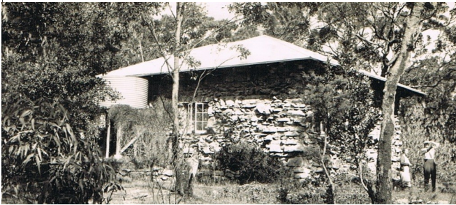
THE STONE HOUSE HIGH RD. c1930