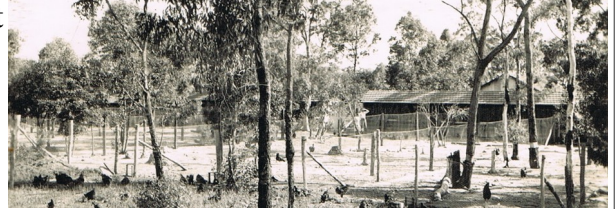
CHOOK FARM OLD BATHURST RD.

Many residents of Blaxland would be unaware that there was once a large Produce Farm in Blaxland on Old Bathurst Road, where Blaxland East Public School, East Blaxland shops, and the new housing development on Mitchell Pass are sited. The farm produced vegetables, chickens, eggs and milk which were sold locally and to the Sydney Markets. There was a