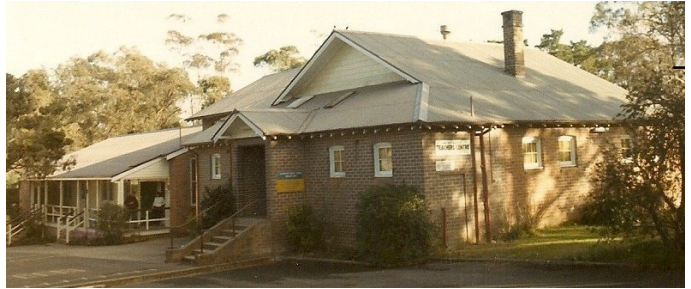
SCHOOL ALTERATIONS 1936

Thus in 1911 a new building was erected, it consisted of 2 classrooms, built of brick and faced Ross St. By 1912-13 with an influx of children, because of the new railway deviation, some classes had to be held in the School of Arts building, and the old wooden school was finally demolished in 1937 after serving the village for 45 years.