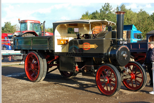
1920 "FODEN" STEAM TRACTOR/LORRY