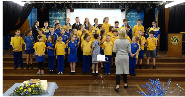
SCHOOL CHOIR SINGS at FUNCTION