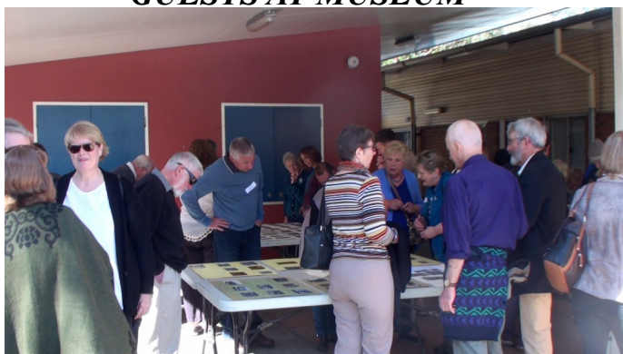
CLASS PHOTO DISPLAY AT SCHOOL