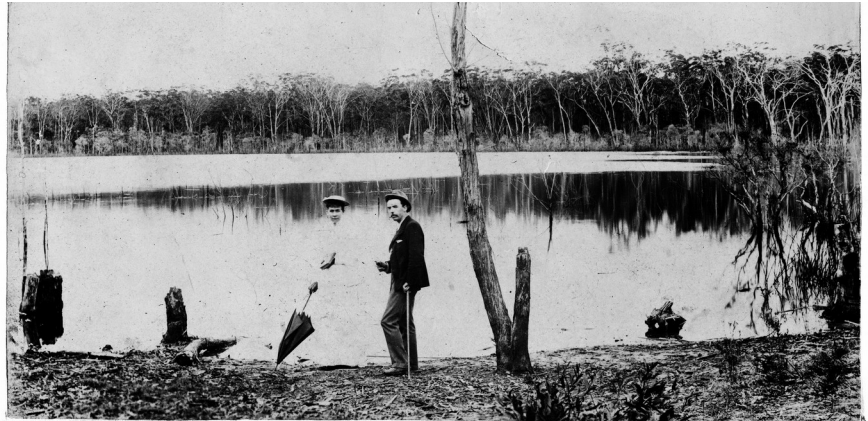
1. GLENBROOK LAGOON c 1900's

On the 12 th May 1813 Blaxland, Wentworth and Lawson left the ford at Emu Plains in an effort to find a way across the Blue Mountains. Blaxland noted in his diary that a good supply of water was discovered at the lagoon in what was to become Glenbrook.