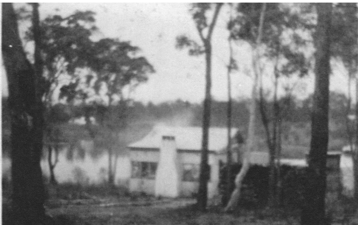
2. ELLIS PROPERTY AT LAGOON c 1948