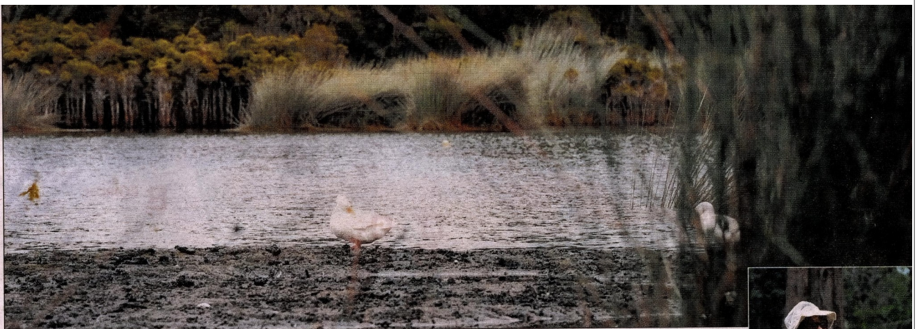
Glenbrook Lagoon has undergone a rejuvenation and has been cleared of weeds.