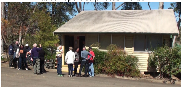
MUSEUM..... CELEBRATION DAY