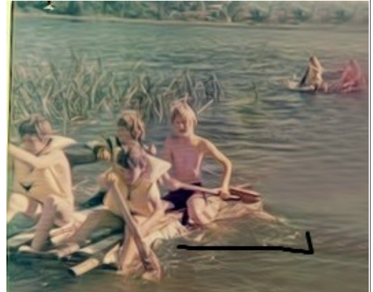
4. SCOUTS on the LAGOON c 1980's