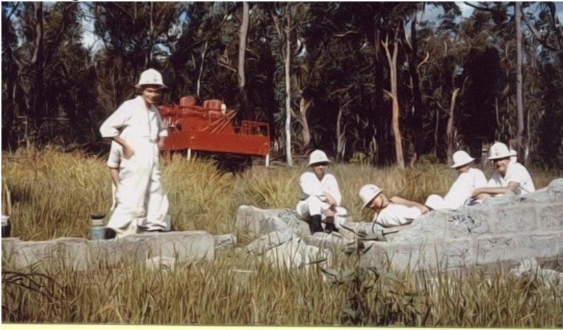
3. RURAL FIRE SERVICE at LAGOON

the lagoon during bush fires as indeed even today, helicopters now fill their buckets with water for fire bombing.