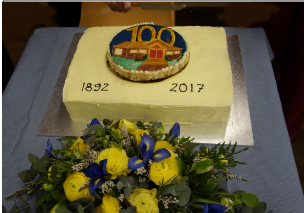
125 yrs CELEBRATION CAKE