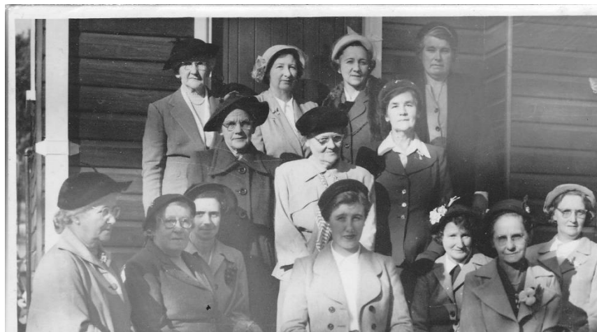
St. Andrews Womens Guild 1954