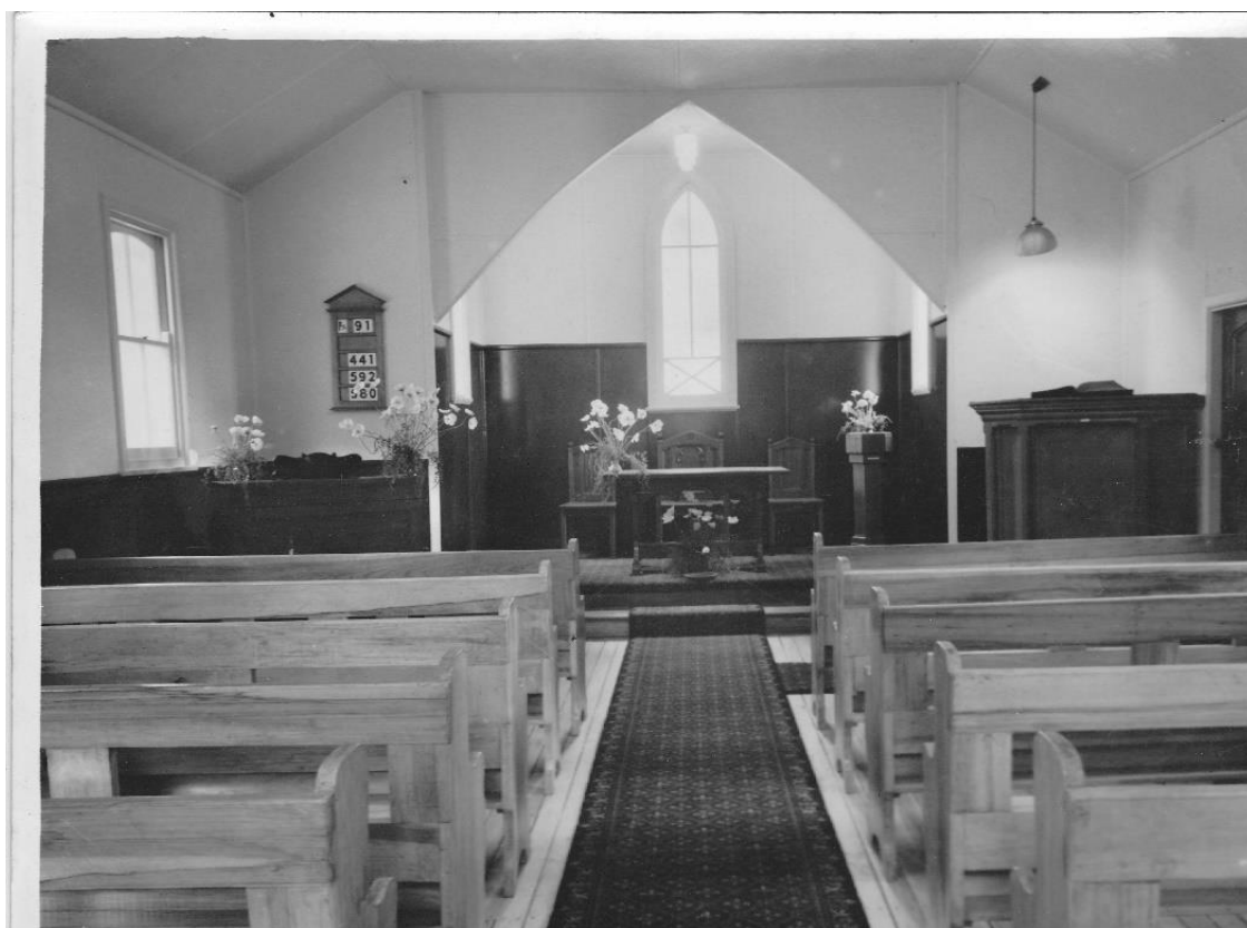
St.Andrews Church Glenbrook 1954