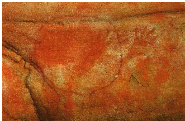
Red Hand Cave

Unfortunately as the popularity of the National Park grew, more visitors came to visit the cave and it was slowly becoming defaced. To stop this awful practice continuing, there is now a grill covering the front of the cave to protect this very interesting part of Darruk history for generations to come.