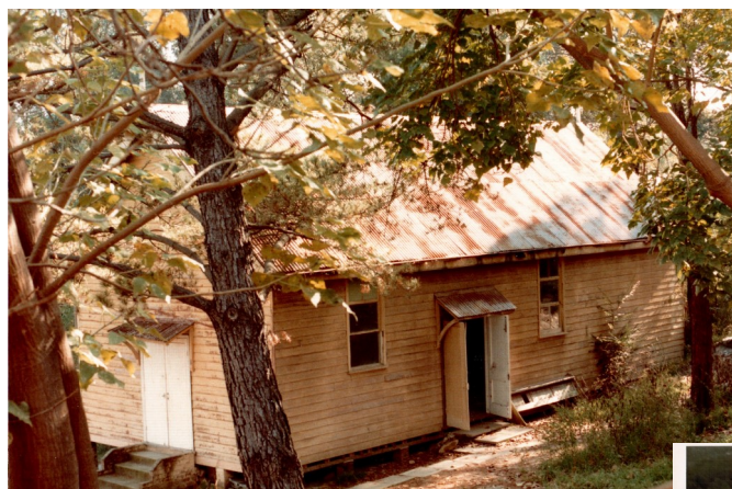
Original St.Finbars Church