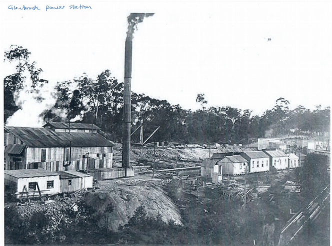
Glenbrook deviation Power House c1912