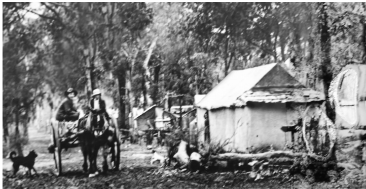
Emu Rd Main Camp Glenbrook

St Finbar's little wooden church in Levy Street, Glenbrook was built and opened in 1912, ninety-nine years after explorers, Blaxland, Wentworth and Lawson, camped near a swamp at the SE corner of what is now Glenbrook Oval. It was a part of Penrith Catholic parish. From 1911-13 an influx of many workers and their families came for the railway deviation works.