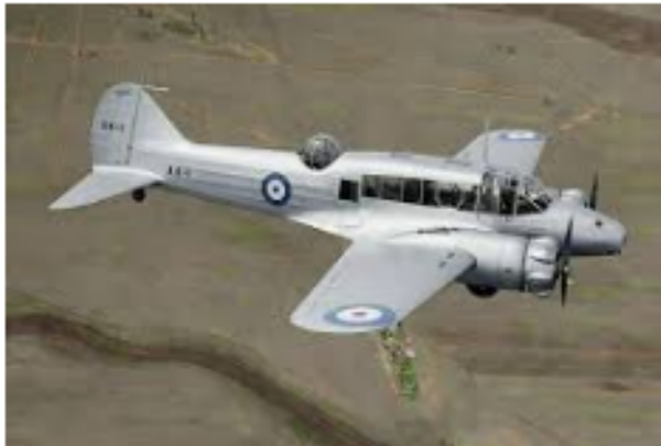
R.A.A.F. Avro Anson

There were no survivors, wreckage was thown everywhere, one engine had fallen on the footpath at the corner of Clifton Ave., and other parts and pieces, including bodies, were all over the place. Then, as now, police had to come from Penrith or Springwood, and the R.A.A.F. from Richmond, so it was some time before any officials arrived. Not so the people from the village, they came from everywhere in no time at all. My mother shut the gate and said that this is no place for children to be at, so although we were the closest to the crash site, we were the only ones not to get near