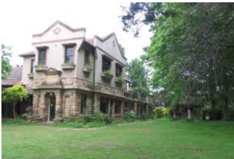
Lidsdale House east terrace