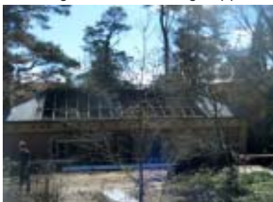
The project starts

An application to the Heritage Branch, NSW Department of Planning, for 50% funding support