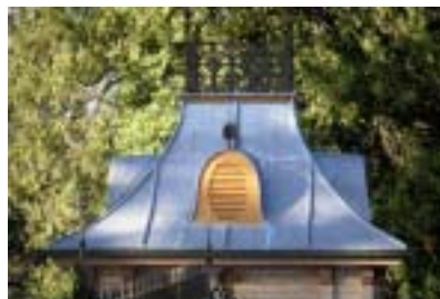
Timber joinery on the tower was refurbished

The original galvanised screws and lead washers were removed and re-used where possible. The new 0.6mm Z600 galvanised corrugated steel sheeting was barrel rolled at Fielders in South Australia to match the profile of the original roofing. All timber joinery on the tower was taken back and treated then painted to match the original colour scheme.