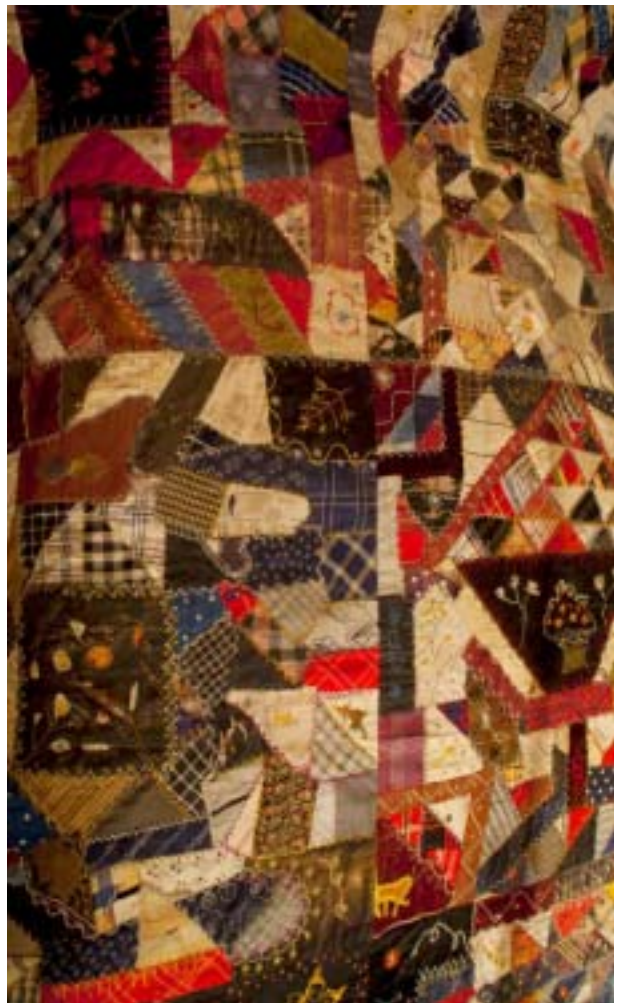
The Leake-Sutton quilt made in Pennsylvania, 1893

She carefully hoarded family memorabilia but was no homebody; having been the town's first postmistress during World War II, founded the Muzzle Loading Gun Club and been an active sportswoman and a bird watcher.