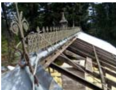
Original ridge capping folded back and iron cresting secured