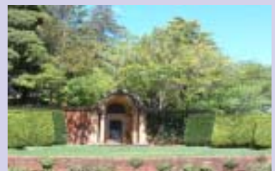
Those attending the meeting may inspect the Everglades Gardens