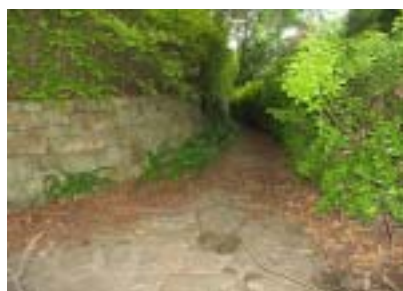
Lower garden path at Lidsdale House

On completion of building repairs a long term plan to resuscitate and restore the garden will be implemented. It seems right that a garden that grew out of the passion of a coal mine owner should now be restored by a coal mining company.