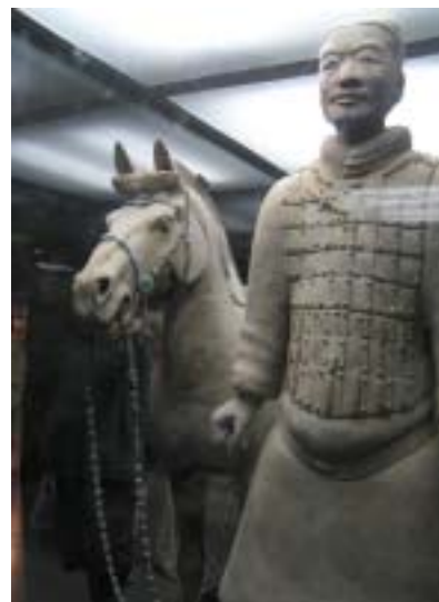
The statues include many of the different military units in the Emperor's army at the time

The name of his dynasty, Qin (pronounced 'chin'), is widely regarded as the origin of the English word China.