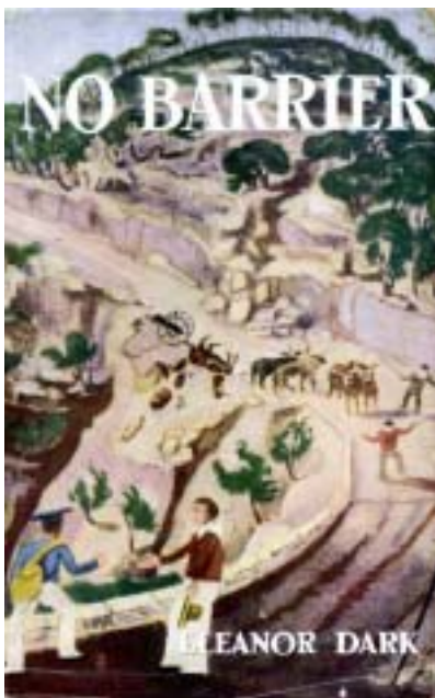
Part three in the famous timeless land trilogy... the discovery of a route over the Blue Mountains

During one of these visits, she consulted with John Low, one of the then local studies librarians on a work-in-progress that was set in the upper Blue Mountains, and discovered the rich treasure trove of