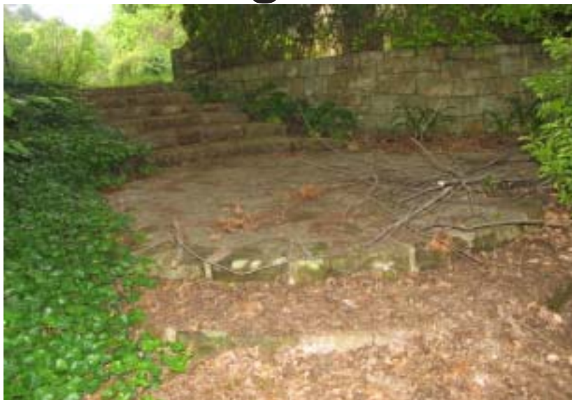
A stone staircase pictured above and a bridge (below) connect various levels of the Lidsdale House gardens

At the northern end of the terrace wall path is one of Sorensen's most amazing design features, a cascade