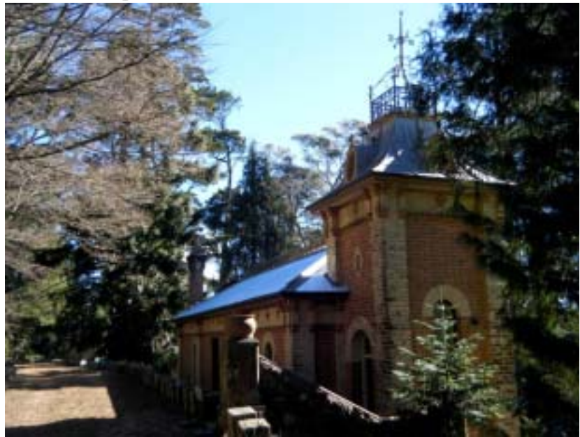
The completed renovations on the Turkish Bathhouse at Mt Wilson

met with success and the roof was replaced in July / August 2010.