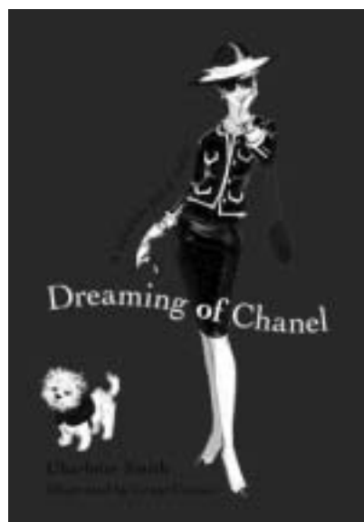
The book cover of Dreaming of Chanel launched at the Carrington Hotel, Katoomba last month