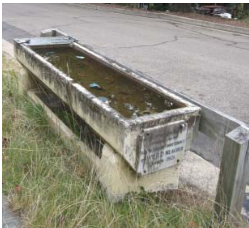
The Lawson horse trough.