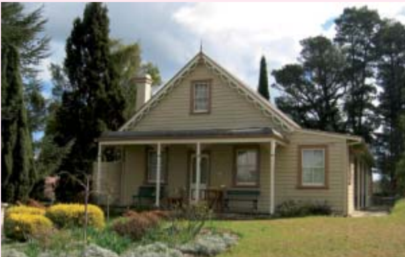
The 1890s cottage Tarella will be open on October 23, 29 and 30.