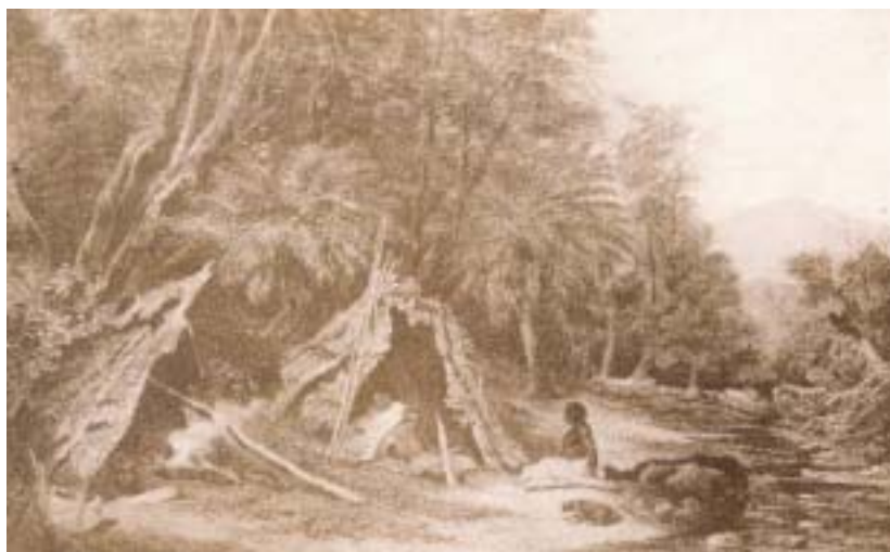
An Aboriginal mia mia [bark hut] and encampment by an unknown artist. The above drawing and the one on the preceding page appeared in 'Historic Blue Mountains 1813-1938' published by the Blue Mountains Shire Council.

He simply recorded them honestly in the same way he recorded his fear of the cliffs or the nature of the vegetation. But he was clearly fascinated and shocked. 11