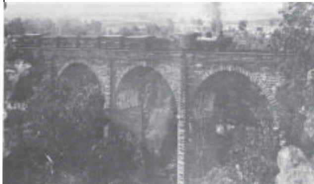
An early steam engine on the Lapstone viaduct drawing empty sheep wagons returning from Homebush saleyards. Image: 'Full Steam Ahead Across the Mountains' by Peter Belbin and David Burke. Methuen 1981 page 28

The rail route across the mountains reached as far as Wentworth Falls (then called Weatherboard) by 1867 but the Lapstone Zig Zag, soon ran into problems: the distance between the top points and bottom points limited the length of trains. The single track also meant that trains travelling in opposite directions had to stop at crossing points.