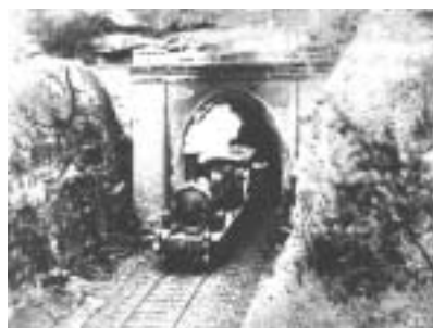
Glenbrook tunnel.

A former railway tunnel in Glenbrook, constructed between 1891 and 1892 to bypass the Lapstone Zig Zag was chosen to