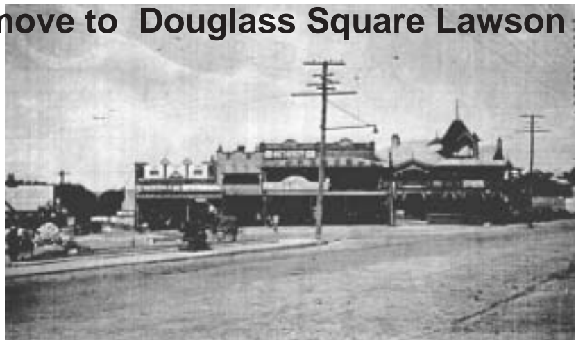
The Lawson shopping centre circa 1920s. In the centre foreground a horse hitched to a cart, drinking from the water trough.