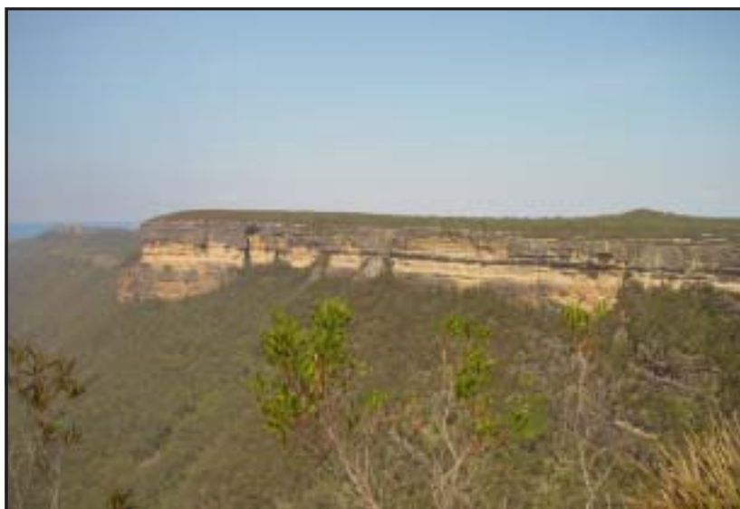
Kanangra Walls. Had Barrallier followed available ridge routes from the Kowmung River, he could have reached here and gone on to cross the mountains near Jenolan Caves and Oberon.

In 1793 Colonel Paterson had tried to sail up the Grose River but was stopped by boulder strewn rapids. Hacking, in 1794 was reported to have penetrated 'further than anyone before'.