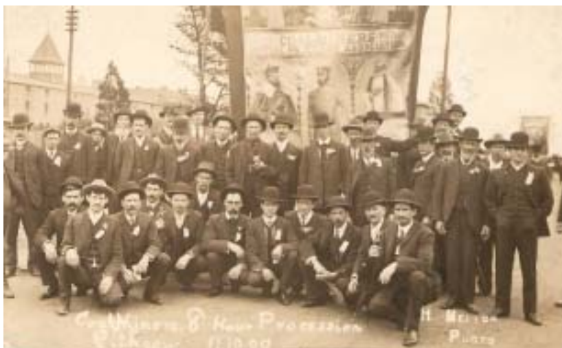
District and lodge officials taken with their banner before the 1900 Eight Hour Day procession.

Many came from the coalmining regions of Scotland, Northern England and Wales.