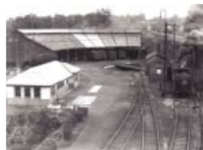
Valley Heights depot circa 1950s

The Roundhouse closed as an operating depot in 1988 and a dedicated membership has maintained this heritage property.