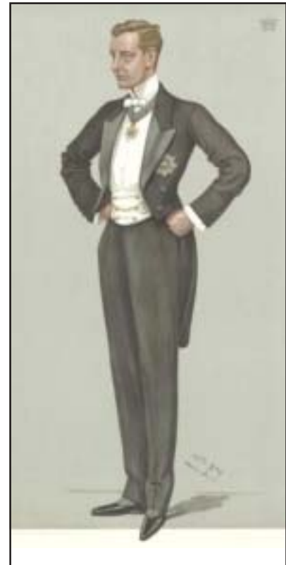
Lord Beauchamp as Governor of NSW in 1899. Drawing by Leslie Ward

William did consider suicide but eventually fled to Wiesbaden where he was convinced by members of his family to put all thoughts of ending his life aside. 7