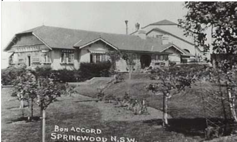
Bon Accord where the former NSW governor officially opened the golf links