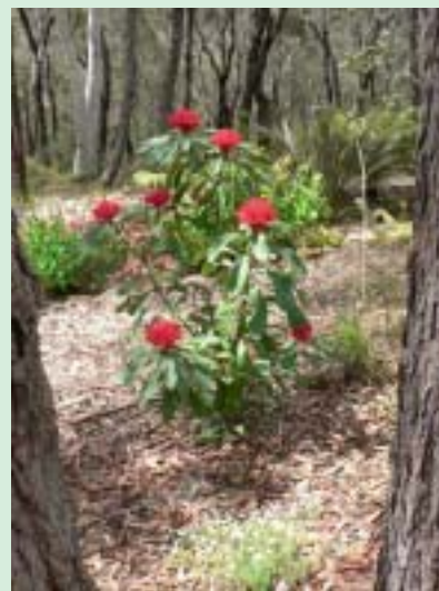
Waratahs in the wild.

Blue Mountains Botanical Garden acknowledges the traditional custodians of this Blue Mountains region the Darug and Gundungurra people and their ancestors.