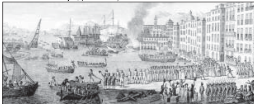
The Anglo-Spanish fleet entering Toulon in 1793