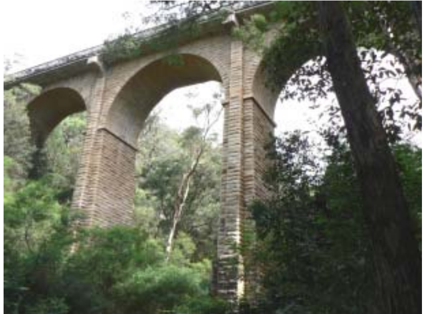
The Lapstone Zig Zag viaduct. May 2011

The first crossing point after Lapstone Zig Zag was at Wascoe's Siding at what is now Glenbrook. The single track would contribute to a fatal accident at Emu Plains in 1878 where eastbound and westbound goods trains collided.