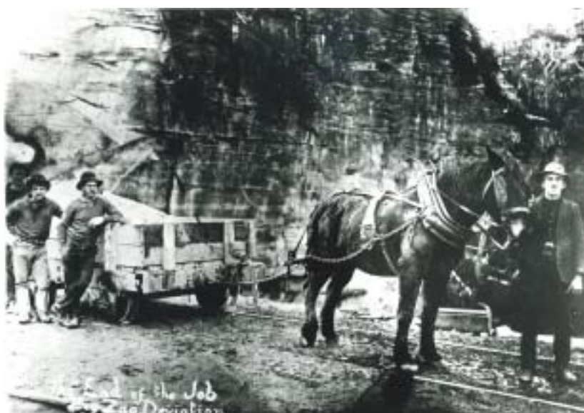
Glenbrook tunnel construction 1910-1913.

store mustard gas, 3 other tunnels close to Sydney were also used for this purpose.