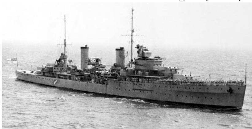
HMAS Sydney

The exact location of the two wrecks was unknown until March 2008.