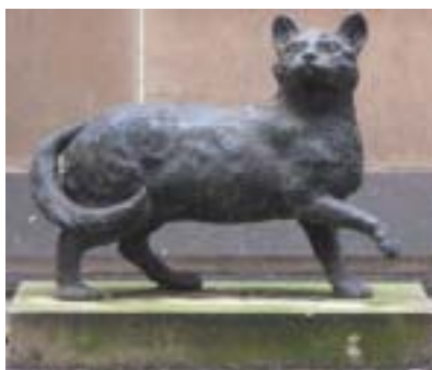
Matthew Flinder's cat Trim, NSW Library, Sydney