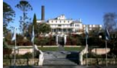
The heritage listed Carrington Hotel, Katoomba