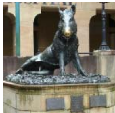
Il Porcellino, Sydney Hospital