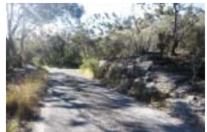
Rock cutting east of trig station