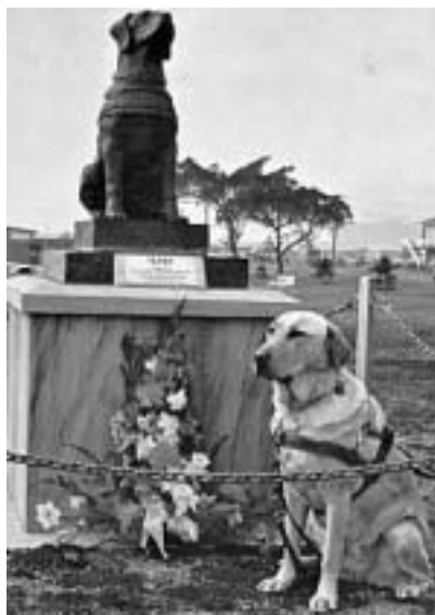
Tessa and monument, Stockton

Tessa, the Guide dog is remembered in Stockton – a realistic bronze Labrador on her haunches complete with guide dog harness.