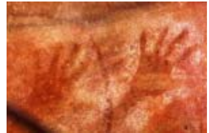
Aboriginal hand stencils in the Red Hand Cave near Glenbrook

So there are many, many hands which we should all wish to grasp, wherever we go in the Mountains and whatever historical curiosity we may happen to have.