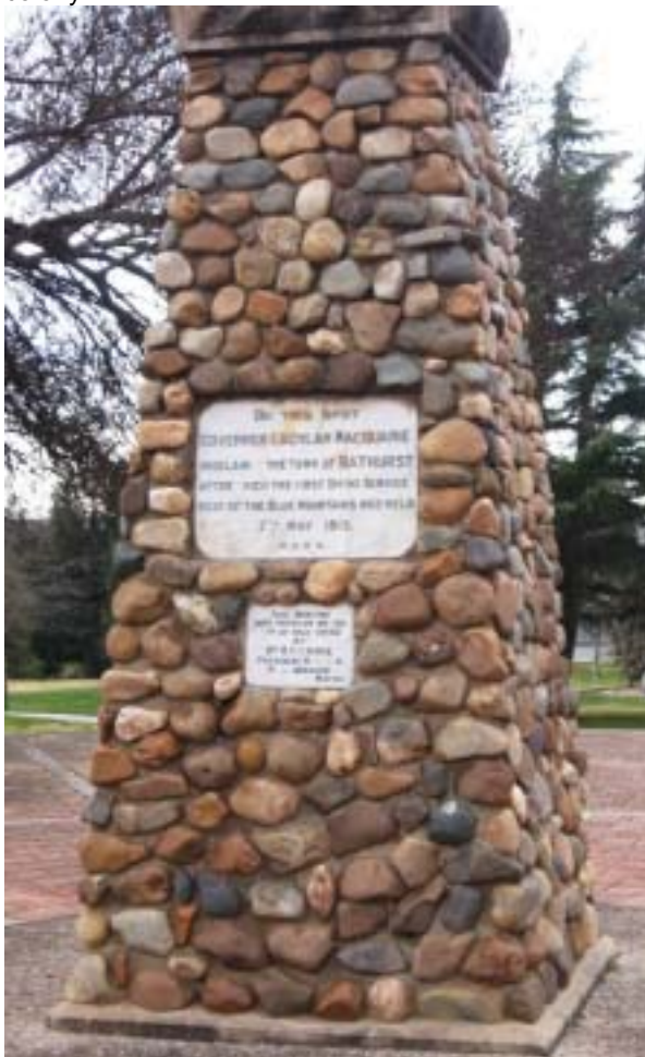
This monument erected by the RAHS marks the location where Macquarie declared the site for Bathurst

After considering its options, the SHR committee concluded that listing of representative portions of Cox's Road would be undertaken as part of the 1813 bicentennial commemorations of the crossing of the Blue Mountains in recognition of the importance of the road in the history of opening up of western NSW.