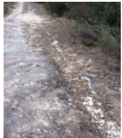
Rockcorry road drain