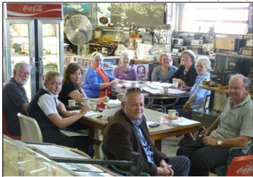
Pictured are members of the group who attended the recent meeting at Simmo's Museum at Glen Davis. On the shelves in the background of the picture are old radios and other collectable on display at Simmo's