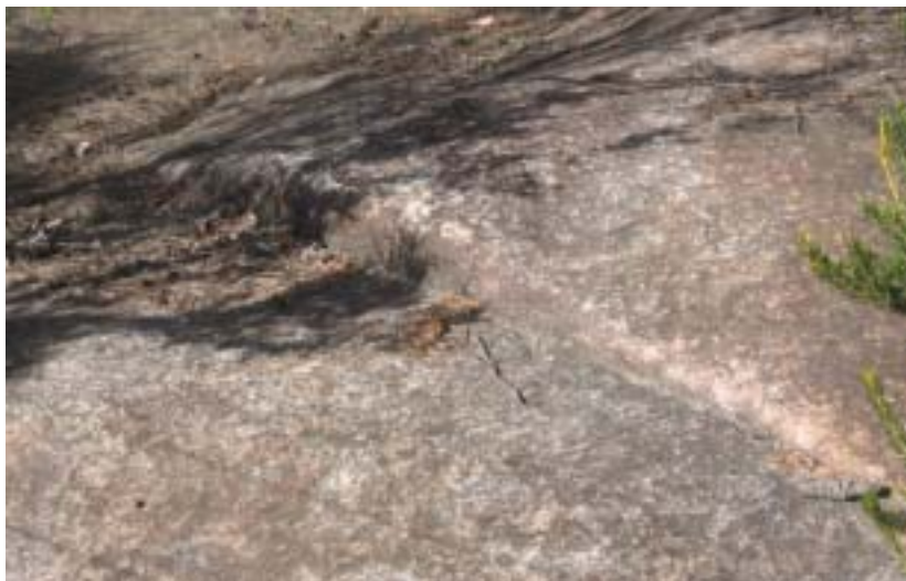
A portion of the Cox's Road near the Woodford trig where carved into the rock is a kerb on either side, both sides, a clear indication that Macquarie's order to Cox to build a road "so that two carriages may pass side by side" was adhered to by Cox.

...and just entered a scrub with stunted timber..... The stonemason went forward to examine a rocky ridge about three miles ahead, and on Monday he will go there to work to level them.