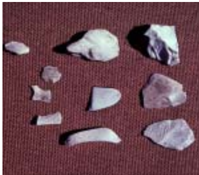
Australian Aboriginal flaked stone tools.

Twenty years ago, in his influential book, Blue Mountains Dreaming , he told how 'As a teenager I began to find stones which did not belong to the geology of the area.' (p.5)