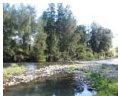
Emu Ford site view to south west

The following photographs document the remaining key features in the vicinity of the crossing: