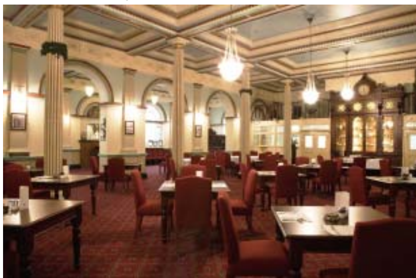
Grand dining room of Katoomba's Carrington Hotel