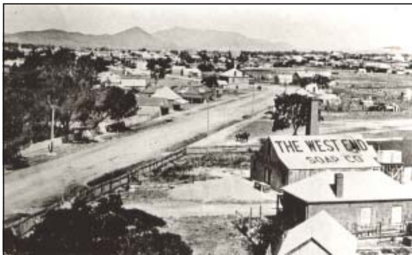
A panorama of the west of Mudgee township in the late 1800s showing the West End soap factory in the foreground and at the top centre West End Hotel to the left of the bend in the unsealed road.

The Colonial Inn Museum and its grounds contain an enormous collection of 19th and early 20th century Australiana: domestic