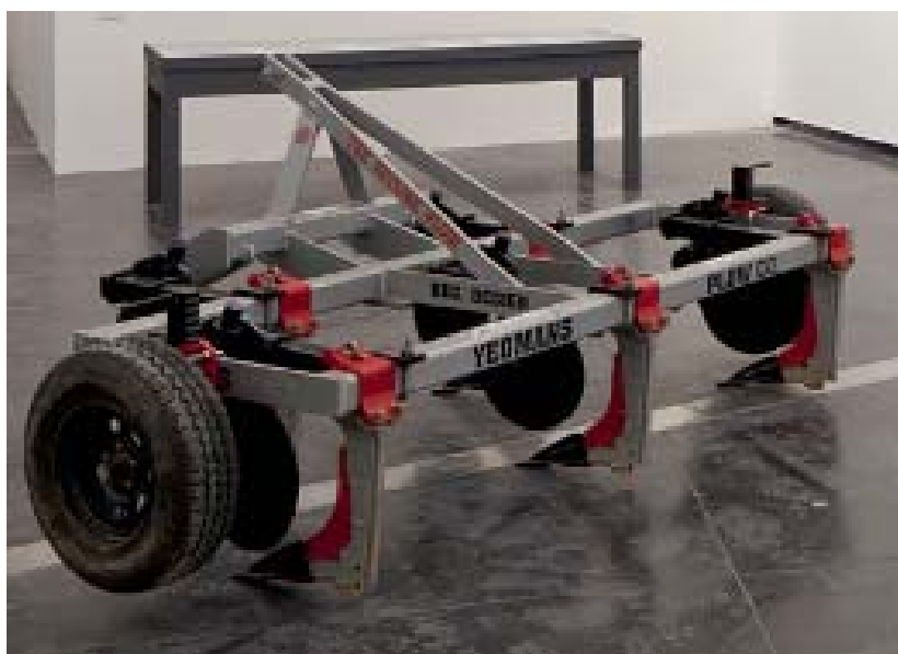
One of Yeomans’ ploughs