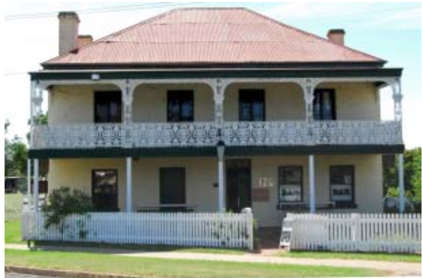
A recent photograph of the Colonial Inn Museum

As a result of the discovery of gold in 1851 at Louisa Creek, now Hargraves, near Mudgee, the population of the district increased dramatically, and the sleepy backwater village of Mudgee became a service centre for the surrounding goldfields.