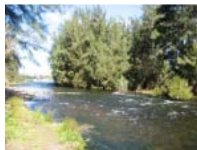
Emu Ford site view to north west