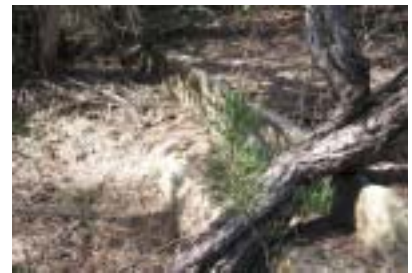
Hand chiselled sandstone kerbing