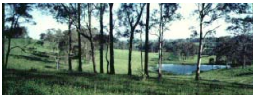
Part of the Nevallan property at North Richmond