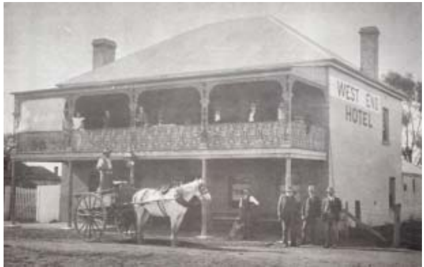
The West End Hotel circa 1880s