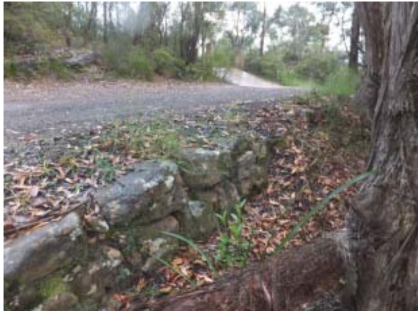
An early retaining wall eastern side of a gravelled section of Taylor Road

Two sections of early retaining wall run along the eastern side of Taylor