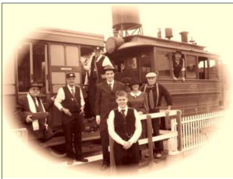
At the inaugural Trains, Trams and T's event at the Valley Heights Loco Depot Heritage Museum early this year, museum volunteers, tram crews and visitors came dressed for the occasion. The event was held to showcase transport in the 1920s.

These plans albeit in its early stages, are very much subject to financial support from the community and are subject to