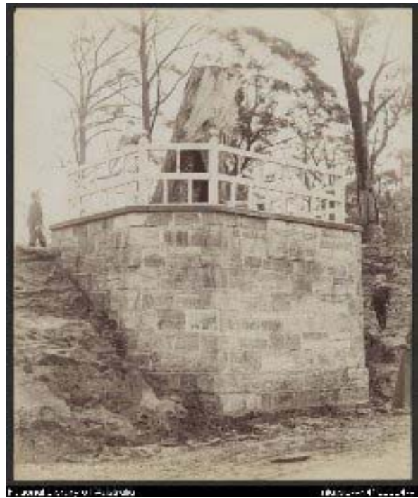
The Explorers Tree, Katoomba ca 1875.