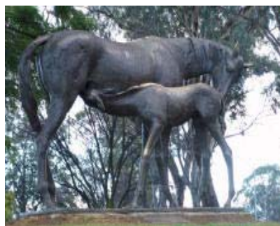
Mare and foal, Scone