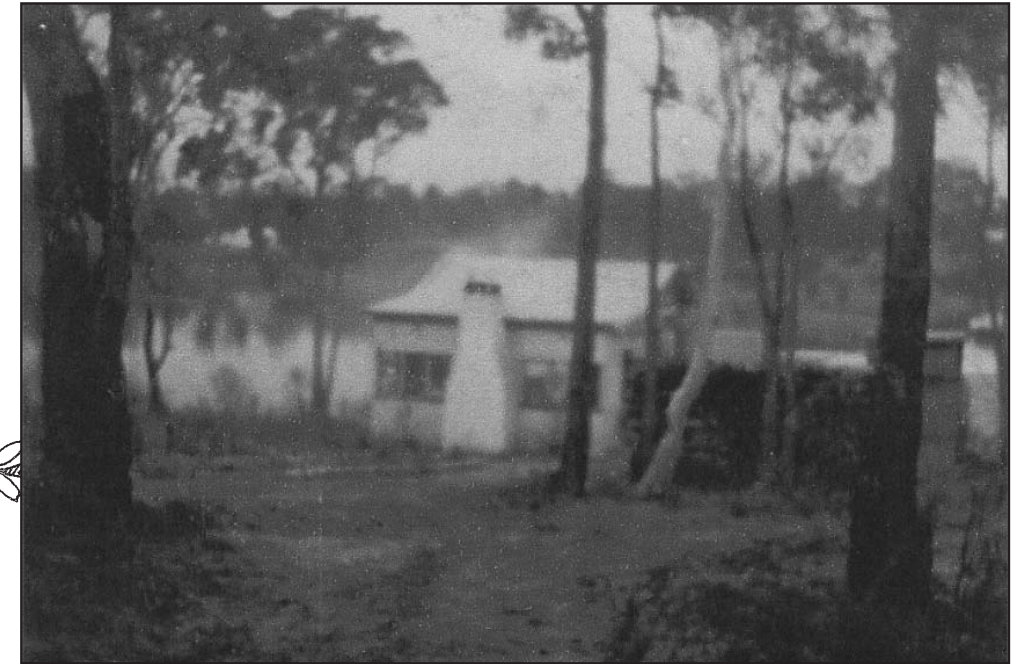
The Ellis family home circa 1940