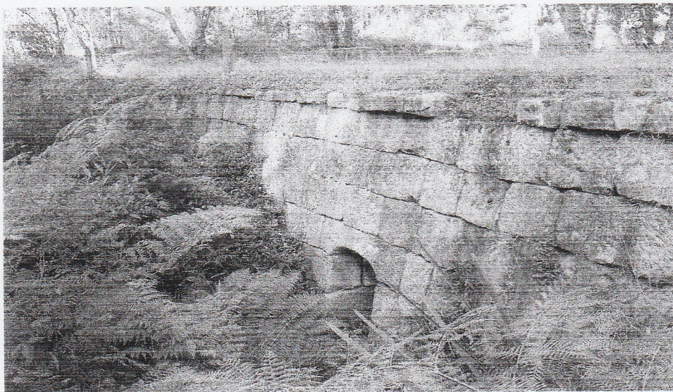
Road and Culvert along Mitchells Pass Road

So it was that the family did not see the Lower Blue Mountains until I moved into Mitchells Pass in 1961.