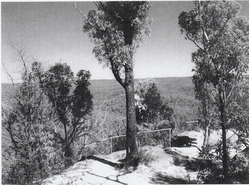
Chalmers Lookout at the Bluff