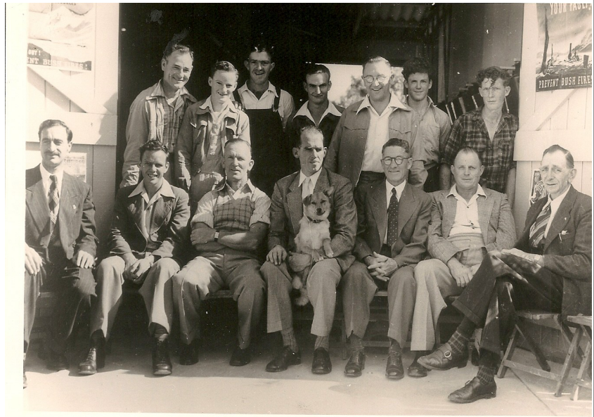
GLENBROOK V. BUSH FIRE BRIGADE OCT. 1951

"Door Knock." So they started—all labour voluntary, and completed the concrete footings. They did another village "Door Knock"—This