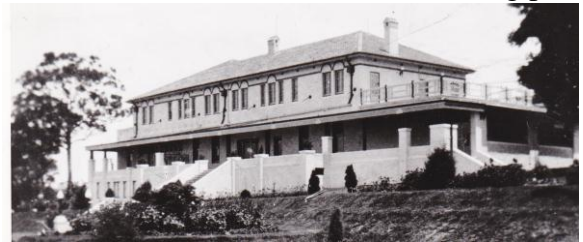
“LOGIE” now R.A.A.F. Ops. Command

In 1949 the Lapstone Hotel was offered to the R.A.A.F. to be used as Eastern Area Headquarters. It was a two story, U shaped building with 57 bedrooms, together with kitchen facilities and dining room situated on Lapstone Hill. There were also sporting/recreational areas which included a swimming pool and 9 hole golf course with practice putting green. In the garden area was a 100+ year old Morten Bay tree which was christened the Yum-Yum tree by the R.A.A.F. boys. It was under this tree that Xmas drinks were served and wonderful Xmas parties held for the members children. Unfortunately the tree was struck by lightning during a storm and had to be removed