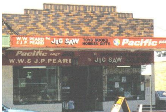
THE JIGSAW c 1980